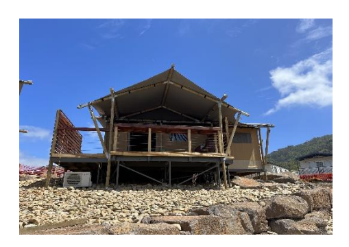
A Beach Tent